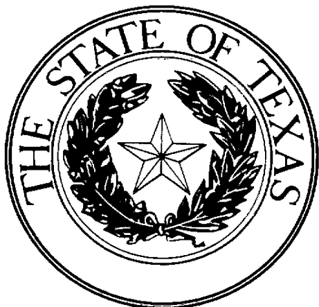
Alberto R. Gonzales Secretary of State

IN TESTIMONY WHEREOF, I have hereunto signed my name officially and caused to be impressed hereon the Seal of State at my office in the City of Austin, on July 17, 1998.