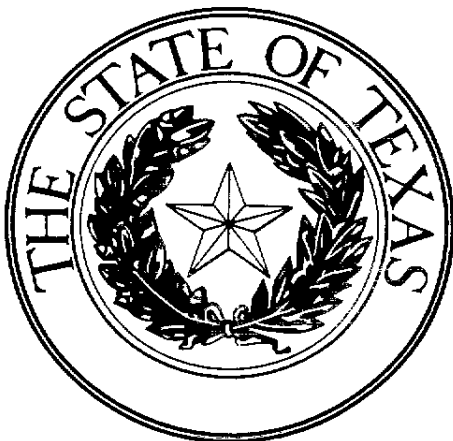
Alberto R. Gonzales Secretary of State

IN TESTIMONY WHEREOF, I have hereunto signed my name officially and caused to be impressed hereon the Seal of State at my office in the City of Austin, on July 23, 1998.