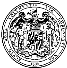
Paul B. Anderson Charter Division