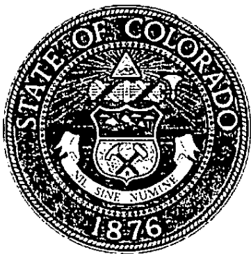
Secretary of State of the State of Colorado

I have affixed hereto the Great Seal of the State of Colorado and duly generated, executed, and issued this official certificate at Denver, Colorado on 03/04/2024 @ 16:30:00 in accordance with applicable law. This certificate is assigned Confirmation Number 15811094.