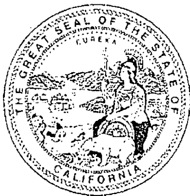
SHIRLEY N. WEBER, PH.D. Secretary of State

IN WITNESS WHEREOF, I execute this certificate and affix the Great Seal of the State of California this day of November 15, 2022.