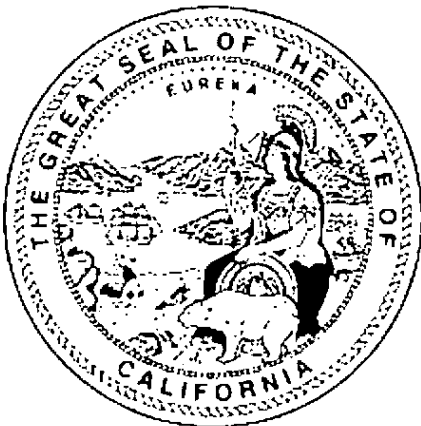
SHIRLEY N. WEBER, PH.D. Secretary of State

IN WITNESS WHEREOF , I execute this certificate and affix the Great Seal of the State of California this day of April 18, 2022.