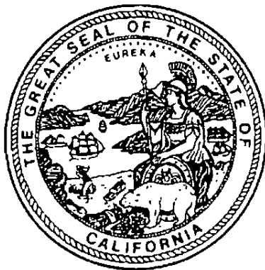
ALEX PADILLA Secretary of State

IN WITNESS WHEREOF , I execute this certificate and affix the Great Seal of the State of California this day of December 28, 2020.