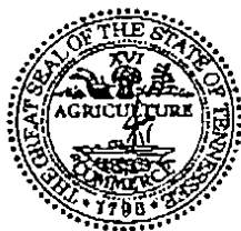
Tre Hargett Secretary of State

State of Tennessee 312 Rosa L. Parks AVE, 6th FL Nashville, TN 37243-1102