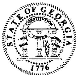
Brian P. Kemp Secretary of State

WITNESS my hand and official seal in the City of Atlanta and the State of Georgia on February 12, 2010