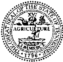
Tre Hargett Secretary of State

State of Tennessee 312 Rosa L. Parks AVE, 6th FL Nashville, TN 37243-1102