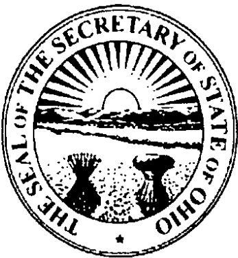
Ohio Secretary of State