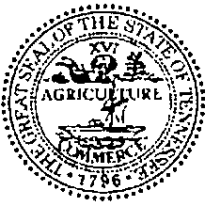
Tre Hargett Secretary of State

CT CORPORATION 2390 E CAMELBACK ROAD PHOENIX, AZ 85016