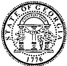
Brian P. Kemp Secretary of State

Docket Number : 16018768 Date Inc/Auth/Filed: 07/15/2004 Jurisdiction : Georgia Print Date : 07/12/2018 Form Number : 211