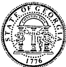
Brian P. Kemp Secretary of State

Docket Number : 15719584 Date Inc/Auth/Filed: 01/06/1992 Jurisdiction : Georgia Print Date : 04/03/2018 Form Number : 211