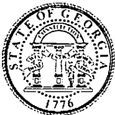
Brian P. Kemp Secretary of State

Docket Number : 15499930 Date Inc/Auth/Filed: 08/24/1999 Jurisdiction : Georgia Print Date : 03/13/2018 Form Number : 211