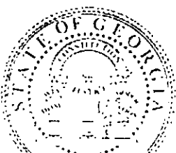
Brian P. Kemp

Docket Number : 14992601 Date Inc/Auth/Filed: 09/20/2016 Jurisdiction : Georgia Print Date : 12/21/2017 Form Number : 211