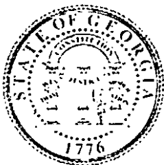
Brian P. Kemp Secretary of State

Docket Number : 15003569 Date Inc/Auth/Filed: 02/26/2015 Jurisdiction : Georgia Print Date : 01/02/2018 Form Number : 211