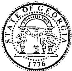
Brian P. Kemp Secretary of State

WITNESS my hand and official seal in the City of Atlanta and the State of Georgia on 02/13/2018.