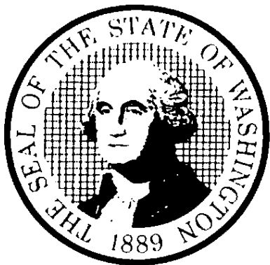
Kim Wyman, Secretary of State

Given under my hand and the Seal of the State of Washington at Olympia, the State Capital