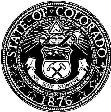
Secretary of State of the State of Colorado

I have affixed hereto the Great Seal of the State of Colorado and duly generated, executed, and issued this official certificate at Denver, Colorado on 08/11/2017 @ 13:47:53 in accordance with applicable law. This certificate is assigned Confirmation Number 10389579 .