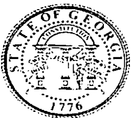
Brian P. Kemp Secretary of State

Docket Number : 14798128 Date Inc/Auth/Filed: 10/11/2007 Jurisdiction : Georgia Print Date : 08/18/2017 Form Number : 211