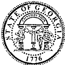
Brian P. Kemp Secretary of State

Docket Number : 14782914 Date Inc/Auth/Filed: 04/28/2011 Jurisdiction : Georgia Print Date : 08/07/2017 Form Number : 211