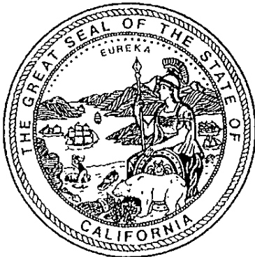
ALEX PADILLA Secretary of State

IN WITNESS WHEREOF, I execute this certificate and affix the Great Seal of the State of California this day of February 21, 2017.