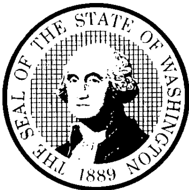
Kim Wyman, Secretary of State

Given under my hand and the Seal of the State of Washington at Olympia, the State Capital