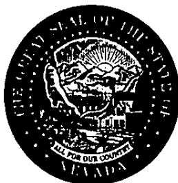
BARBARA K. CEGAVSKE Secretary of State

Electronic Certificate Certificate Number: C20160817-0701 You may verify this electronic certificate online at http://www.nvsos.gov/