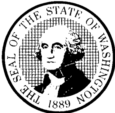
Kim Wyman, Secretary of State

Given under my hand and the Seal of the State of Washington at Olympia, the State Capital