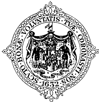
Paul B. Anderson Charter Division

301 West Preston Street, Baltimore, Maryland 21201 Telephone Balto. Metro (410) 767-1344 / Outside Balto. Metro (888) 246-5941 0009851999 MRS (Maryland Relay Service) (800) 735-2258 TT/Voice Fax (410) 333-7097