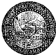
BARBARA K. CEGAVSKE Secretary of State

Electronic Certificate Certificate Number: C20151006-0037 You may verify this electronic certificate online at http://www.nvsos.gov/