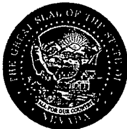
BARBARA K. CEGAVSKE Secretary of State

Electronic Certificate Certificate Number: C20150831-1884 You may verify this electronic certificate online at http://www.nvsos.gov/