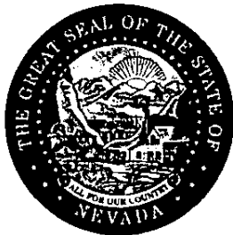
BARBARA K. CEGAVSKE Secretary of State

Electronic Certificate Certificate Number: C20150309-1992 You may verify this electronic certificate online at http://www.nvsos.gov/