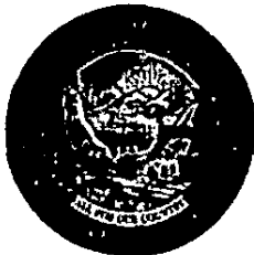
ROSS MILLER Secretary of State

Electronic Certificate Certificate Number: C20141002-2320 You may verify this electronic certificate online at http://www.nvsos.gov/