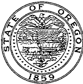
KATE BROWN, Secretary of State

In Testimony Whereof, I have hereunto set my hand and affixed hereto the Seal of the State of Oregon.