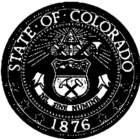
Secretary of State of the State of Colorado

I have affixed hereto the Great Seal of the State of Colorado and duly generated, executed, authenticated, issued, delivered and communicated this official certificate at Denver, Colorado on 07/31/2014 @ 10:15:07 pursuant to and in accordance with applicable law. This certificate is assigned Confirmation Number 8916200.