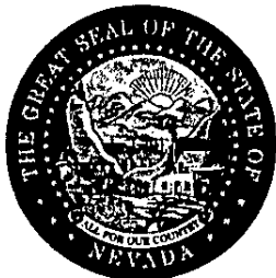
ROSS MILLER Secretary of State

Electronic Certificate Certificate Number: C20140624-0285 You may verify this electronic certificate online at http://www.nvsos.gov/