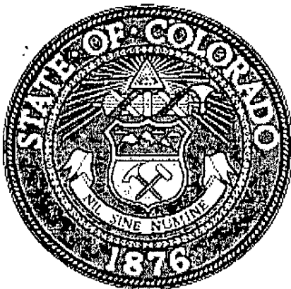
Secretary of State of the State of Colorado

I have affixed hereto the Great Seal of the State of Colorado and duly generated, executed, authenticated, issued, delivered and communicated this official certificate at Denver, Colorado on 04/17/2014 @ 13:34:21 pursuant to and in accordance with applicable law. This certificate is assigned Confirmation Number 8825307.