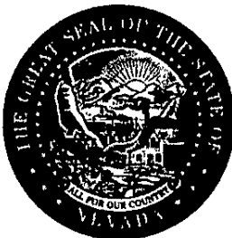
ROSS MILLER Secretary of State

Electronic Certificate Certificate Number: C20121115-1197 You may verify this electronic certificate online at http://www.nvsos.gov/