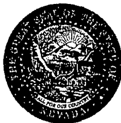
[Signature] ROSS MILLER Secretary of State

IN WITNESS WHEREOF, I have hereunto set my hand and affixed the Great Seal of State, at my office on November 28, 2012.