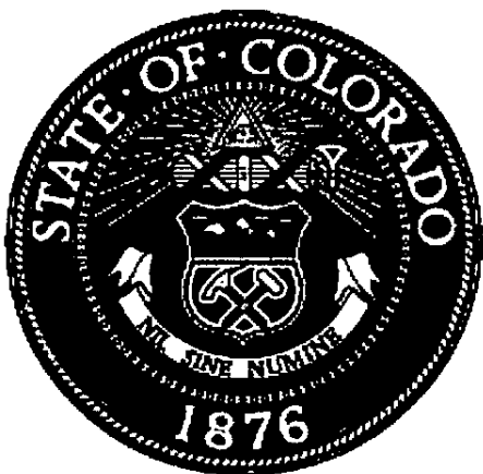
Secretary of State of the State of Colorado

I have affixed hereto the Great Seal of the State of Colorado and duly generated, executed, authenticated, issued, delivered and communicated this official certificate at Denver, Colorado on 11/23/2011 @ 07:28:24 pursuant to and in accordance with applicable law. This certificate is assigned Confirmation Number 8098182.