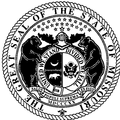
Secretary of State

Certification Number: 14311398-1 Reference: Verify this certificate online at https://www.sos.mo.gov/businessentity/soskb/verify.asp