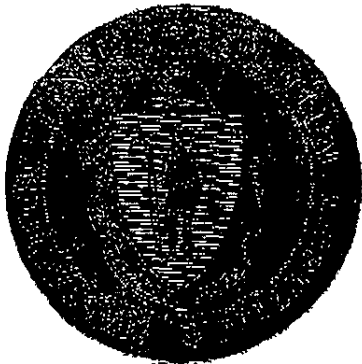
Secretary of the Commonwealth