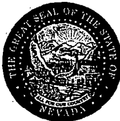
ROSS MILLER Secretary of State

Electronic Certificate Certificate Number: C20110120-0988 You may verify this electronic certificate online at http://www.nvsos.gov/