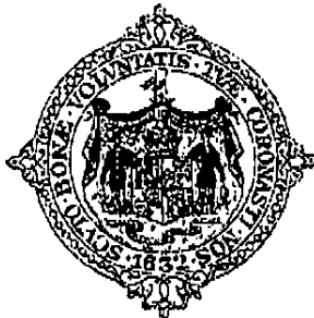
Paul B. Anderson Charter Division

301 West Preston Street, Baltimore, Maryland 21201 Telephone Balto. Metro (410) 767-1340 / Outside Balto. Metro (888) 246-5941 MRS (Maryland Relay Service) (800) 735-2258 TT/Voice Fax (410) 333-7097