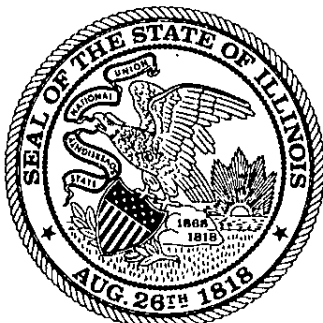
EXHIBIT TRANSFER, INC., A DOMESTIC CORPORATION, INCORPORATED UNDER THE LAWS OF THIS STATE ON AUGUST 14, 2003, APPEARS TO HAVE COMPLIED WITH ALL THE PROVISIONS OF THE BUSINESS CORPORATION ACT OF THIS STATE RELATING TO THE PAYMENT OF FRANCHISE TAXES, AND AS OF THIS DATE, IS IN GOOD STANDING AS A DOMESTIC CORPORATION IN THE STATE OF ILLINOIS.