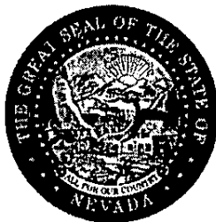
ROSS MILLER Secretary of State

Electronic Certificate Certificate Number: C20101013-2057 You may verify this electronic certificate online at http://www.nvsos.gov/