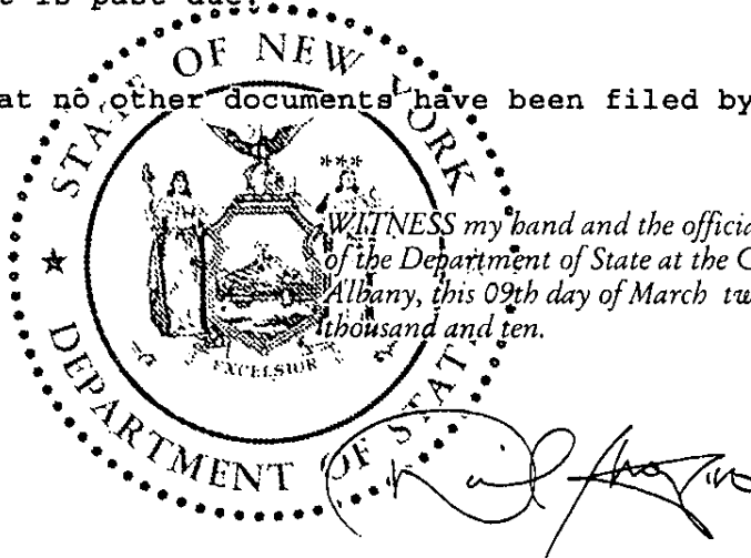
First Deputy Secretary of State

I further certify, that no other documents have been filed by such Corporation.