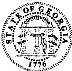
Brian P. Kemp Secretary of State

WITNESS my hand and official seal in the City of Atlanta and the State of Georgia on June 1, 2010