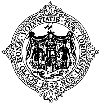
Paul B. Anderson Charter Division

301 West Preston Street, Baltimore, Maryland 21201 Telephone Balto. Metro (410) 767-1344 / Outside Balto. Metro (888) 246-5941 0006266333 MRS (Maryland Relay Service) (800) 735-2258 TT/Voice Fax (410) 333-7097