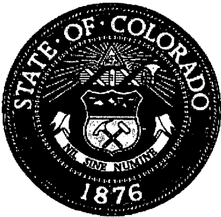
Secretary of State of the State of Colorado

I have affixed hereto the Great Seal of the State of Colorado and duly generated, executed, authenticated, issued, delivered and communicated this official certificate at Denver, Colorado on 07/28/2011 @ 14:03:57 pursuant to and in accordance with applicable law. This certificate is assigned Confirmation Number 8005742.