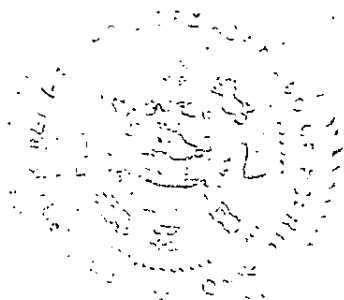
KENNETH D. McCLINTOCK Secretary of State

IN WITNESS WHEREOF , sign the present and cause to be affixed on it the Great Seal of the Commonwealth of Puerto Rico, in the City of San Juan, today, September 30, 2009.