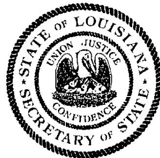
Secretary of State 34218561N

In testimony whereof, I have hereunto set My hand and caused the Seal of my Office To be affixed at the City of Baton Rouge on, September 3, 2009